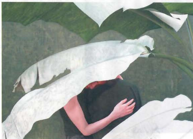
4 Fences, oil on linen, 30 x 24"