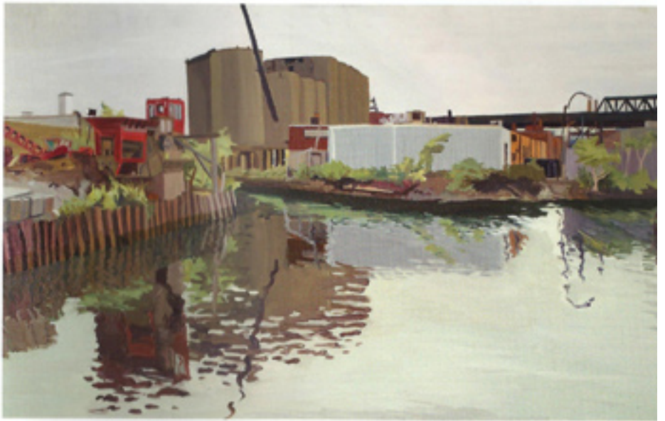
ROCK CRUSHER AND SILOS