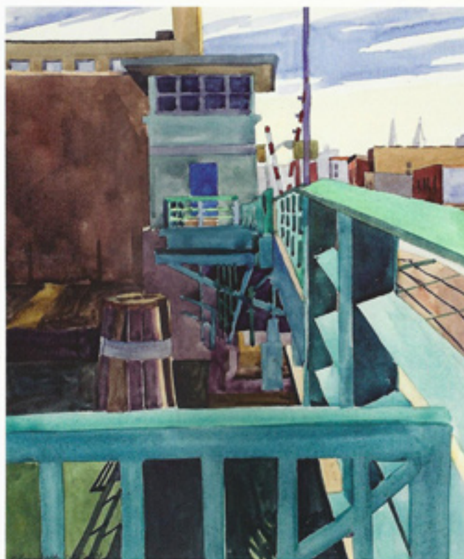
UNION ST. BRIDGE