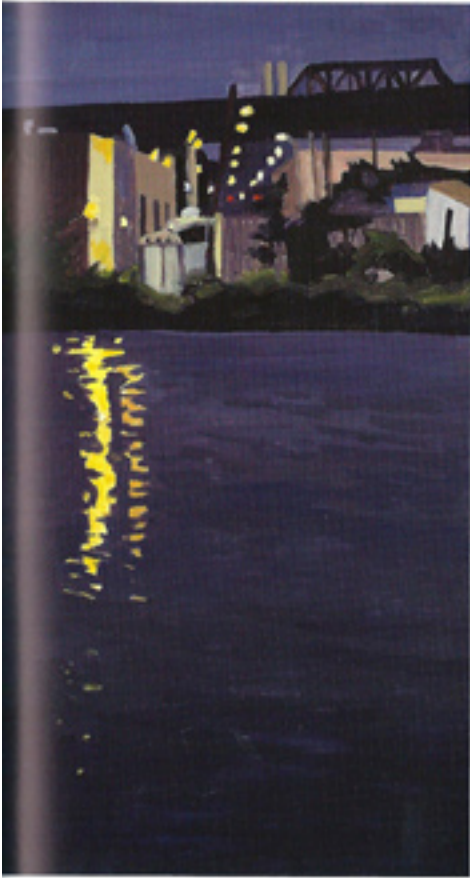
NIGHT LIGHTS AT THIRD ST.