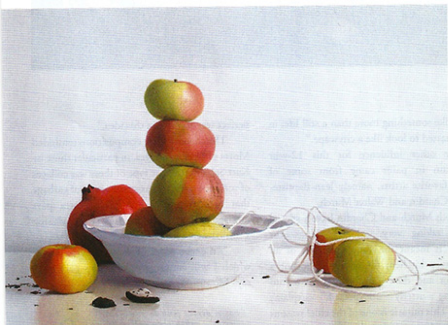
STACKED III, OIL ON PANEL, 10½ X 15½"