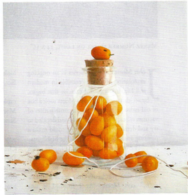
PULL, OIL ON PANEL, 12 X 12"