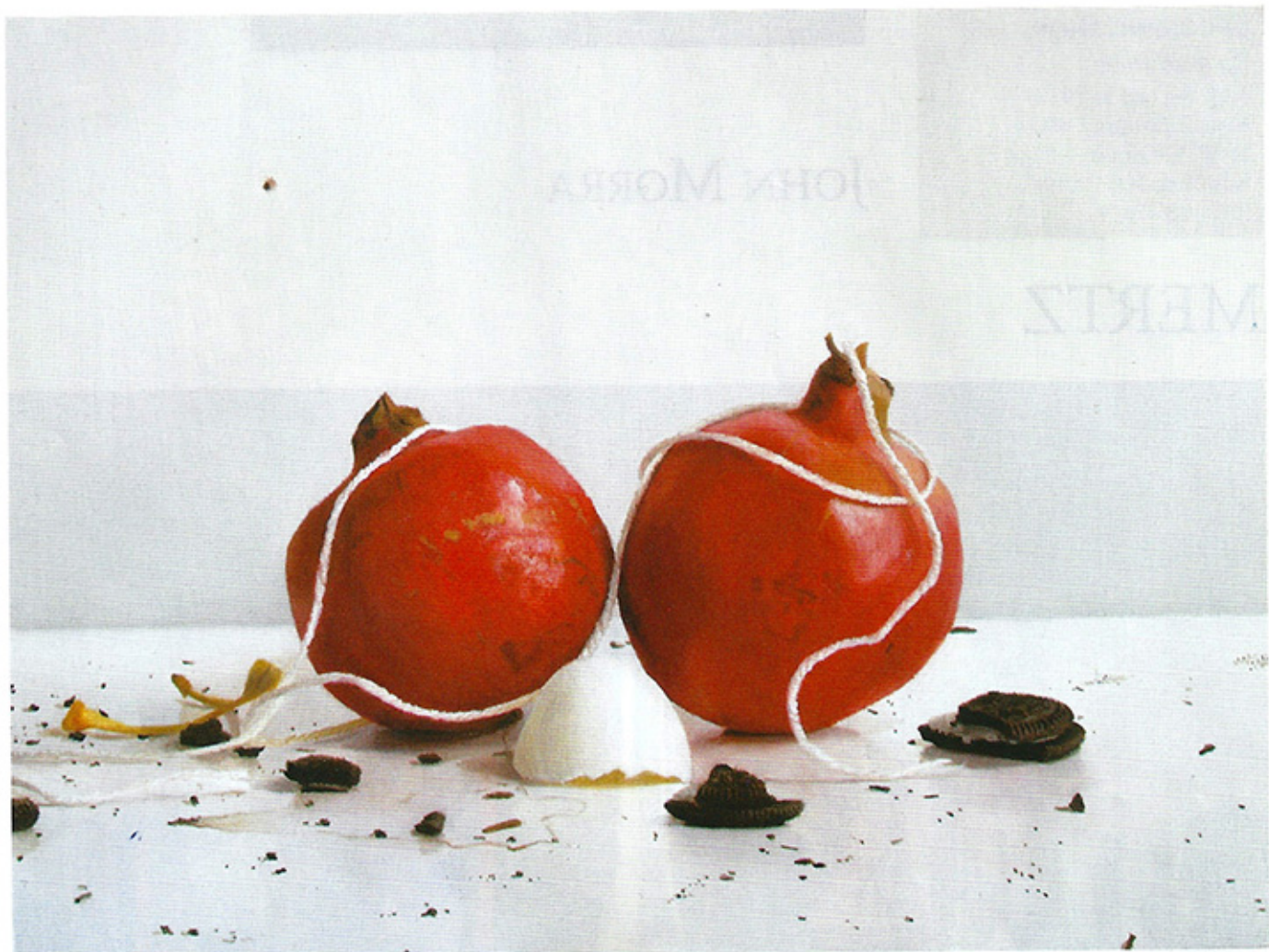
LA FAMILIA, OIL ON PANEL, 9 X 12"