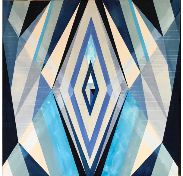
RD013-17, mixed media on canvas, 50x50"