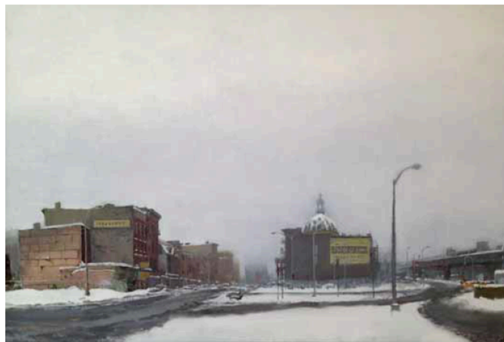
Island , oil on linen, 24 x 30"

has painted on and off since 1998. Similarly, Minefield is a view he started painting in 2006. "So seven years later there's still something I'm looking for there," he