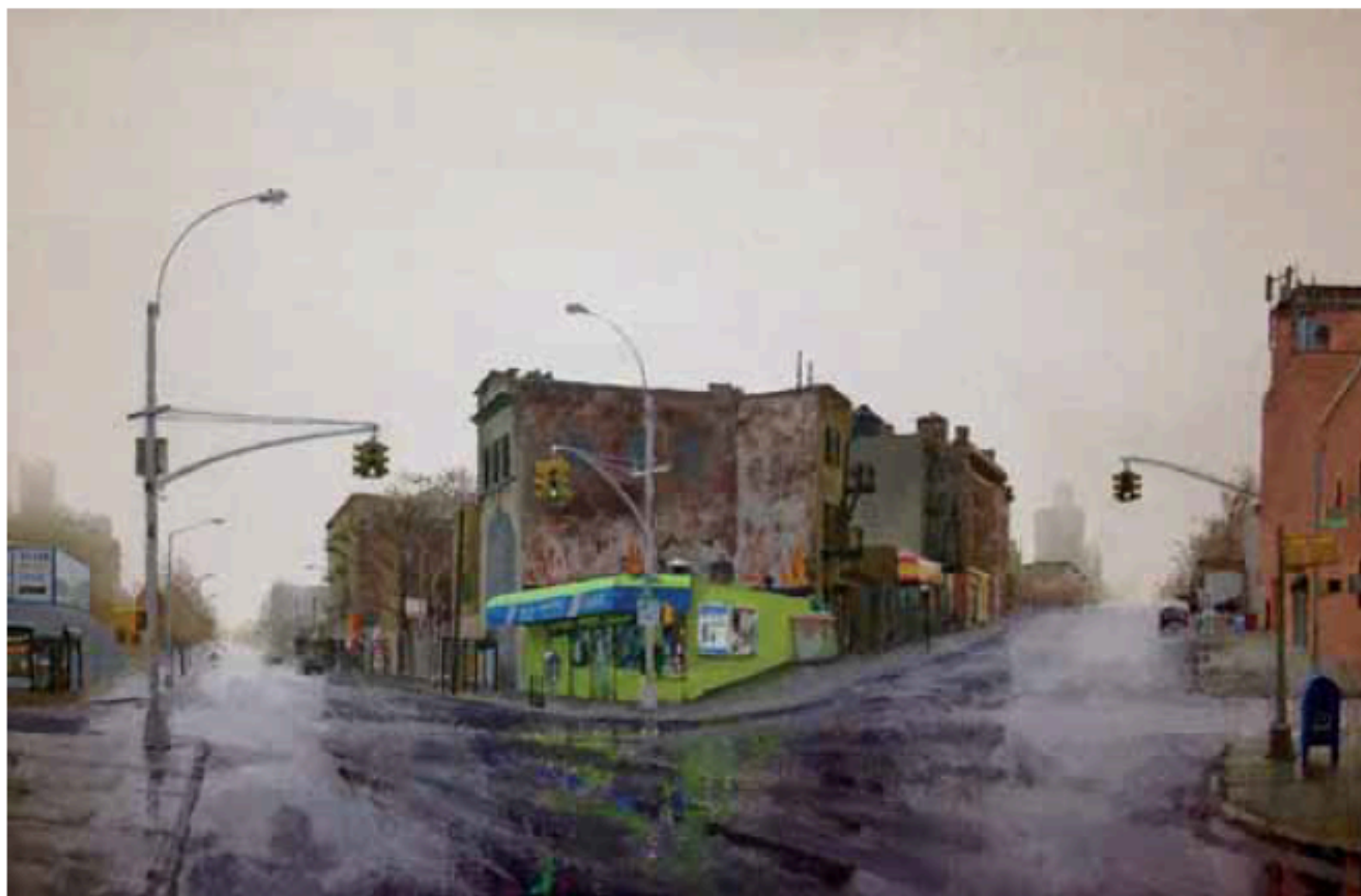
Fronde , oil on linen, 14 x 21"