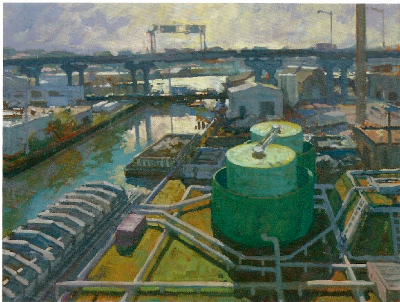
GOWANUS CANAL, EVENING, OIL ON CANVAS, 22 X 28"