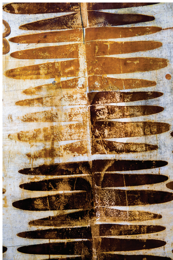
Detail of Totem/Tar, oil on canvas, 72x80”

GEORGE BILLIS GALLERY 525 WEST 26TH STREET, GROUND FLOOR NEW YORK, NY, 10001 PHN: 212.645.2621 EMAIL: GALLERY@GEORGEBILLIS.COM WWW.GEORGEBILLIS.COM