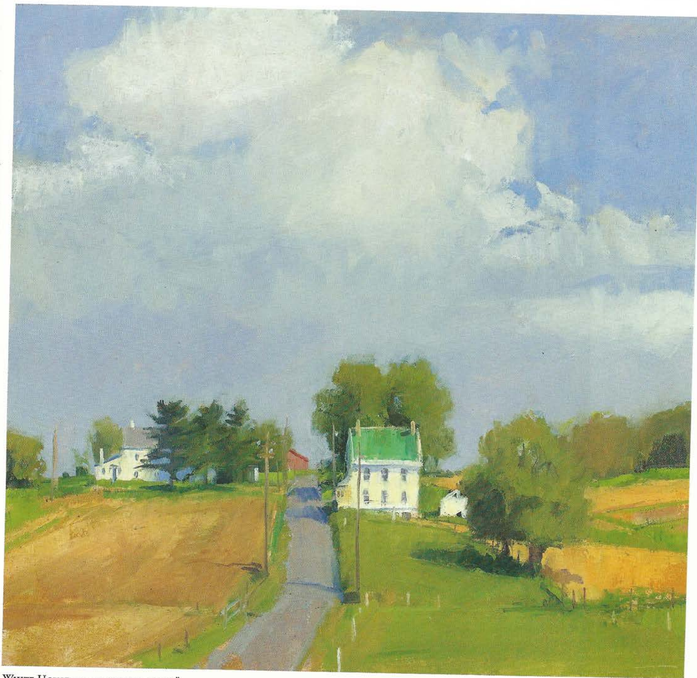
WHITE HOUSE, OIL ON CANVAS, 13 X 14"

more than an accurate rendering of a specific place.