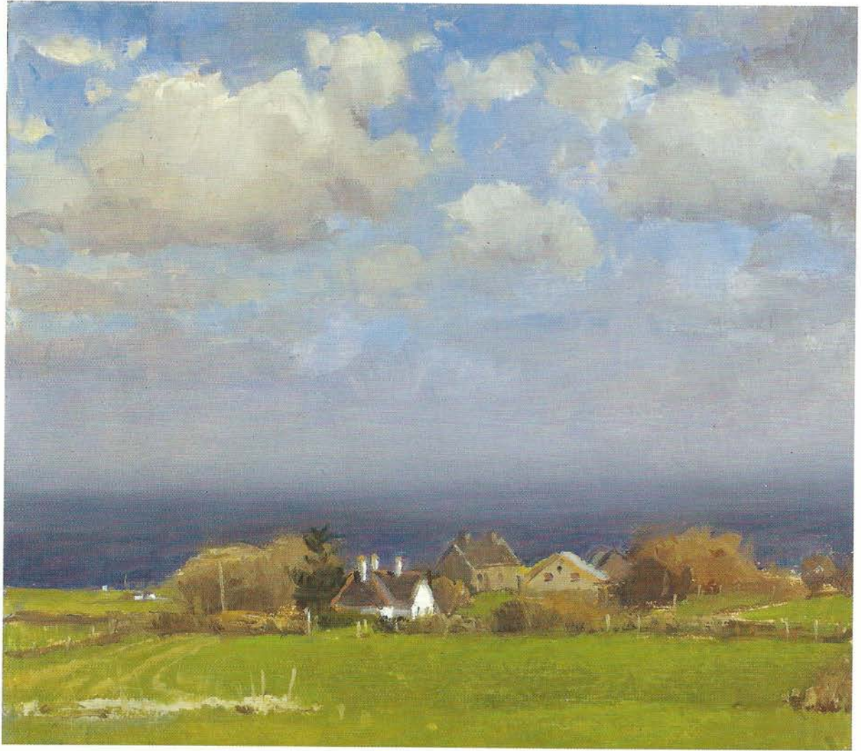
OCEAN FARM, OIL ON PANEL, 10 X 11"