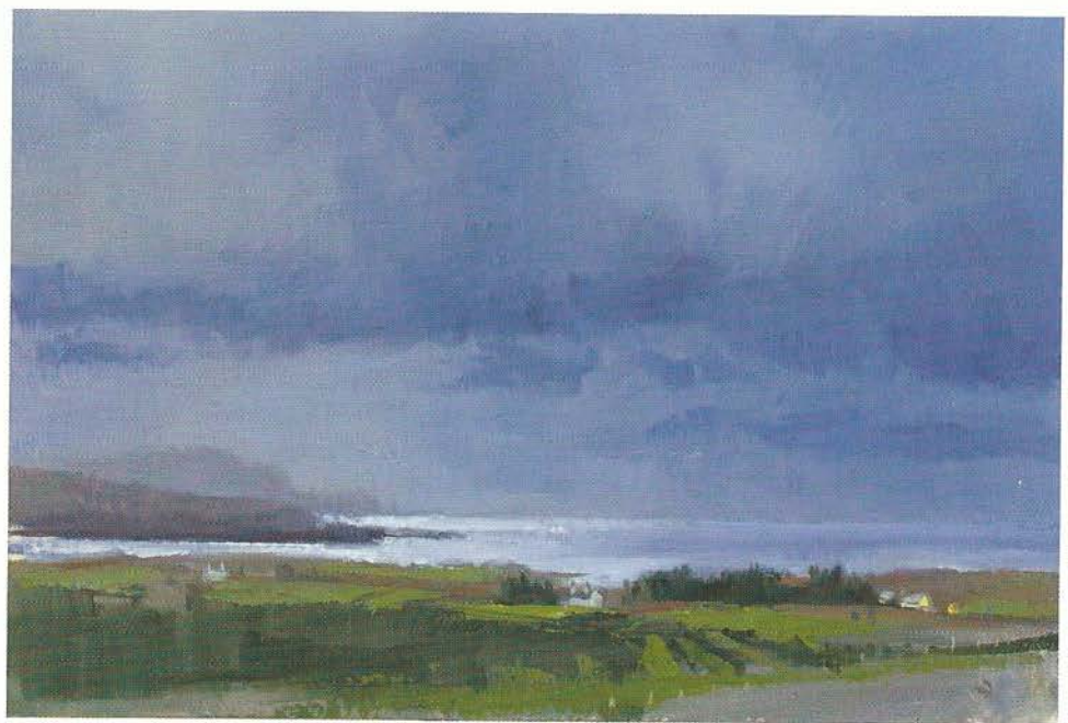
WEST FROM THE TIGHES, OIL ON PANEL, 10 X 11"