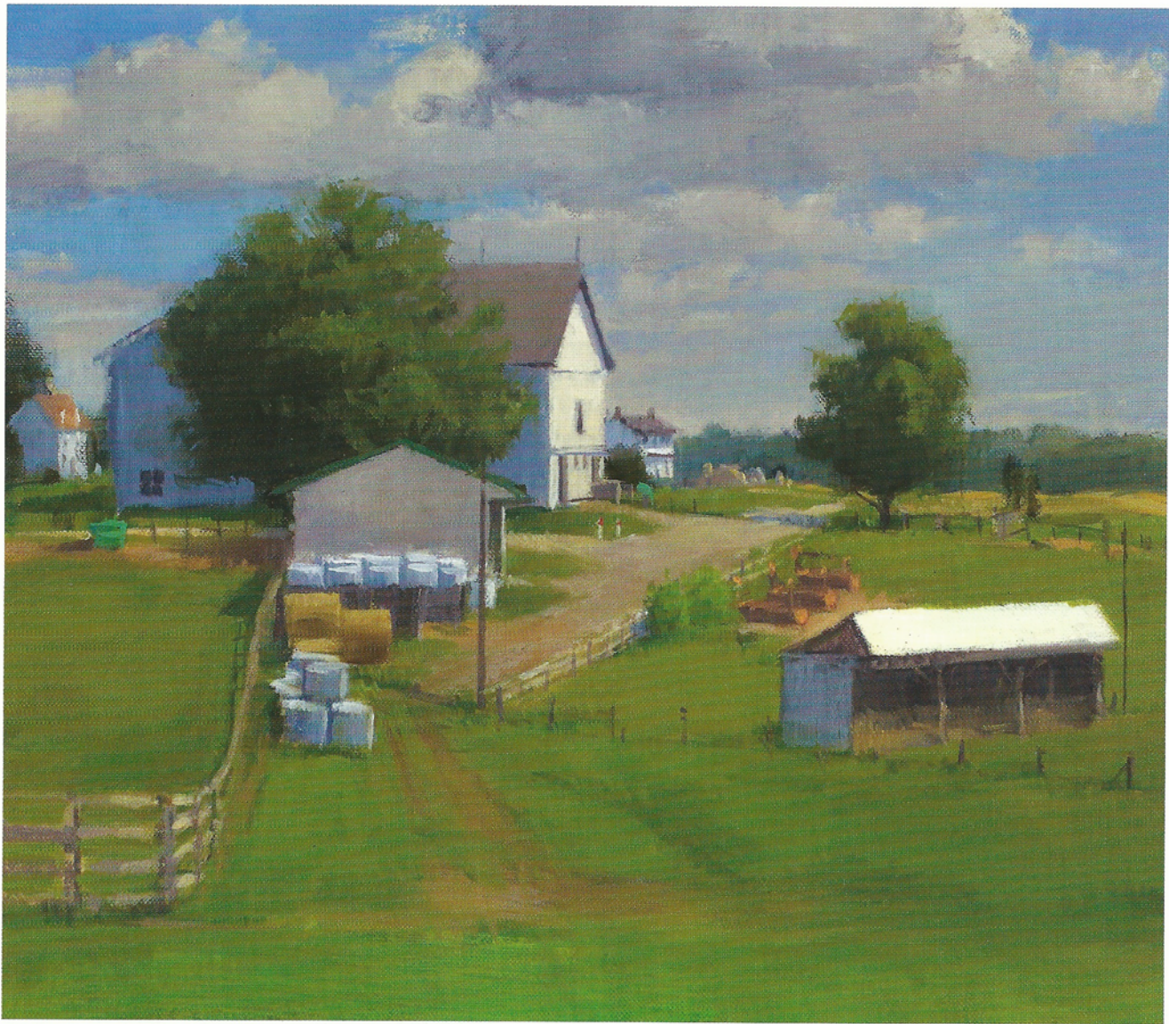
OUT BUILDINGS, OIL ON CANVAS, 12 X 14"