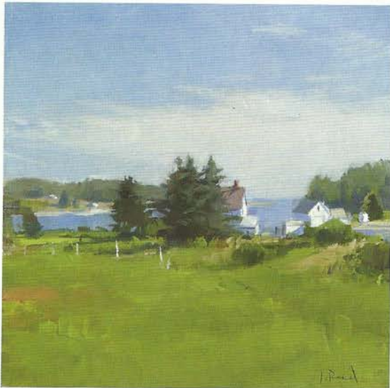
HEAD HARBOR, ACRYLIC ON PAPER, 5½ X 5½"