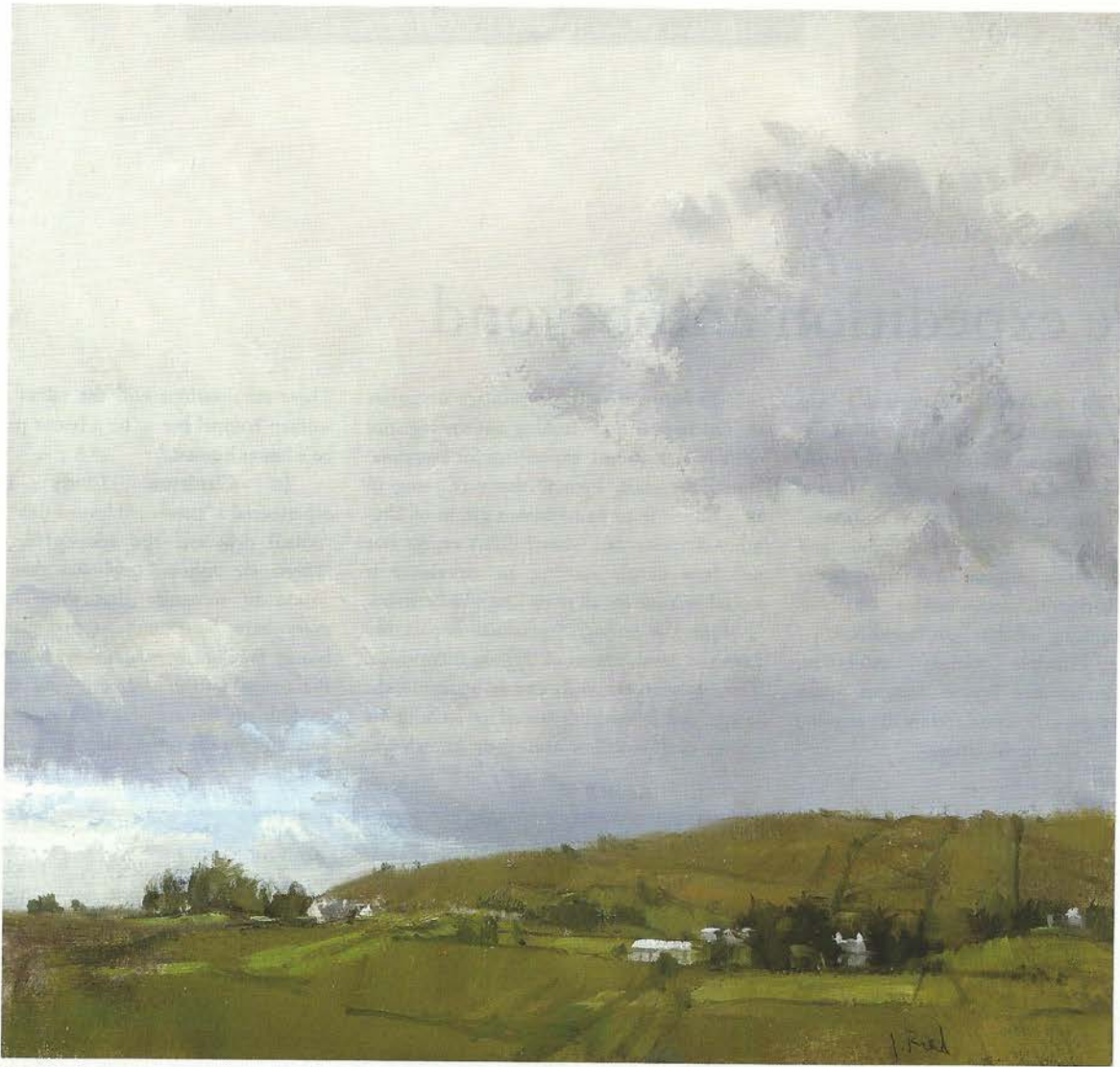
MOVING SKY, OIL ON PANEL, 11 X 10"