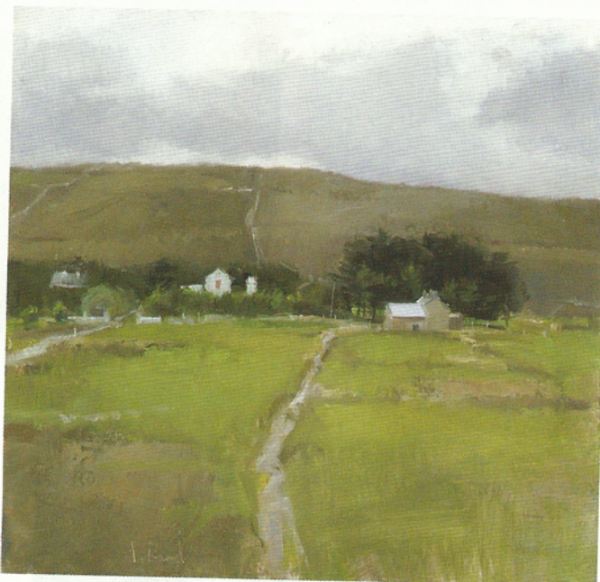
BELDERG, OIL ON PANEL, 11 X 10"