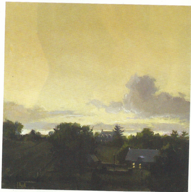
LAST LIGHT, OIL ON PANEL, 14 X 12"