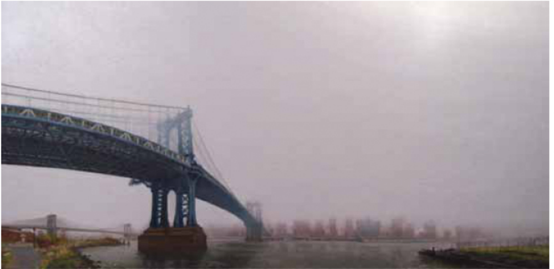
UNTITLED, OIL ON LINEN, 30 X 60"