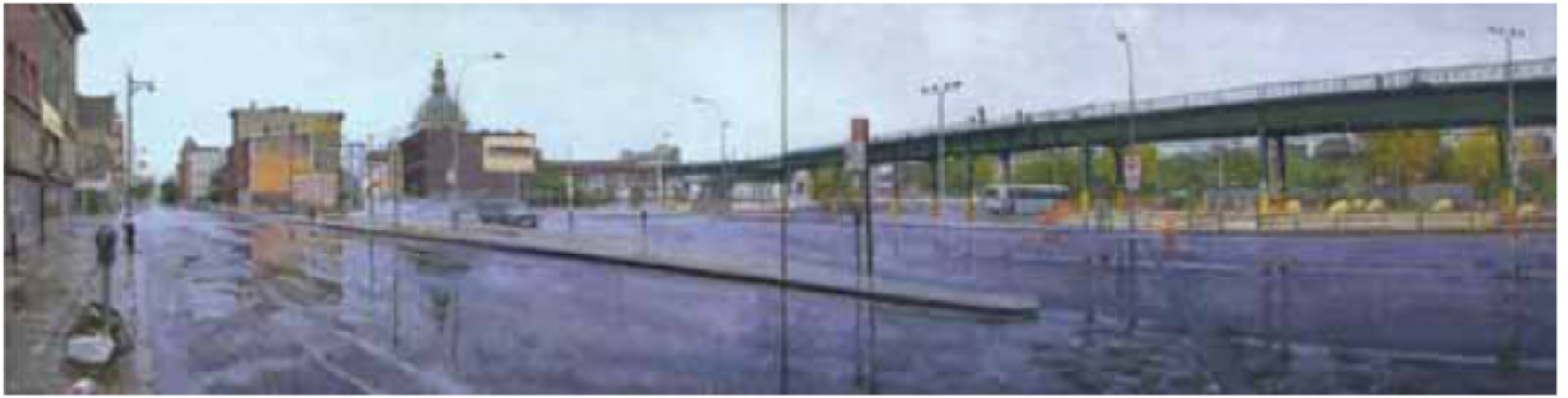
ELEVATED, OIL ON LINEN, 14 X 54"